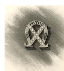
This beautiful engraving of the Chi Omega badge was made in 1907 by Wright, Kay & Co. of Detroit. It was purchased on eBay and donated to the Executive Headquarters by a generous alumna.

Chi Omegas: Please duplicate this form, fill it out, and place it in your jewelry box next to your badge.